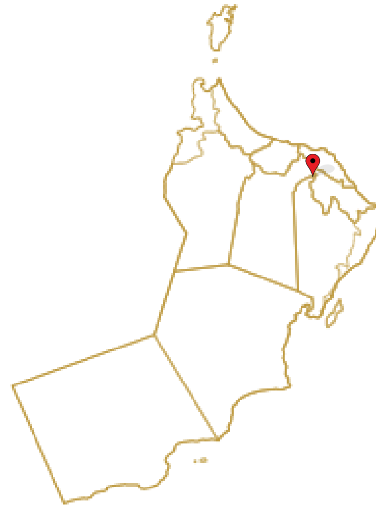
Madayn Industrial Area Samail